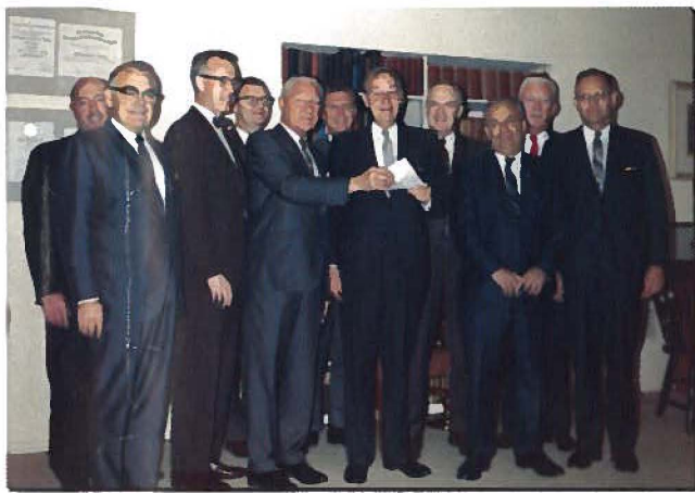
First Membership Check to the Foundation from SCWUA.

With an ever-growing number of state, local and other agencies becoming involved in the Foundation, the Southern California Water Utilities Association helped the Foundation establish the membership program in 1967, ensuring a financial base for continued operations.