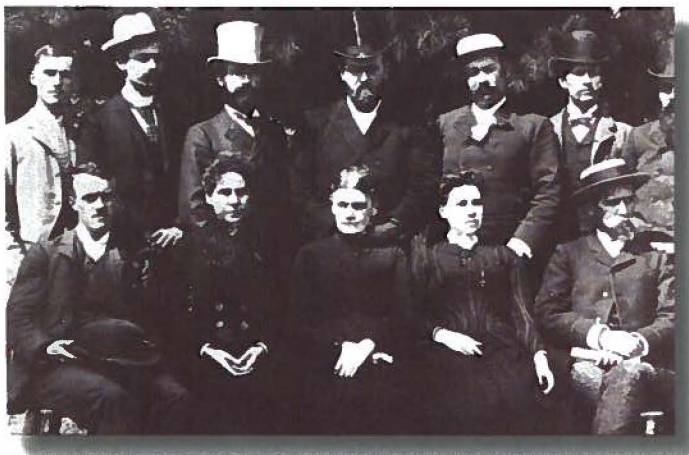
USC's first identifiable faculty. The picture was take in 1880.

In 1880, members of the Los Angeles region Methodist Episcopal Conference founded the University of Southern California. The school was host to 53 students and 10 teachers. Today, celebrating its 125th anniversary, the school boasts a student body of over 32,000 and 3,000 full-time faculty. Incidentally, tuition to attend the University back in 1880