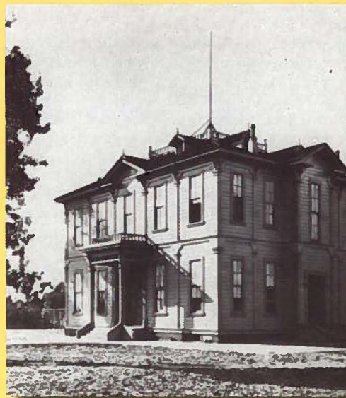
USC's first building, finished October 4, 1880. The building still stands on campus and is known as the Widney Alumni House.

was $15.00 per term, and students were not allowed to leave the city without the knowledge and consent of the university president.